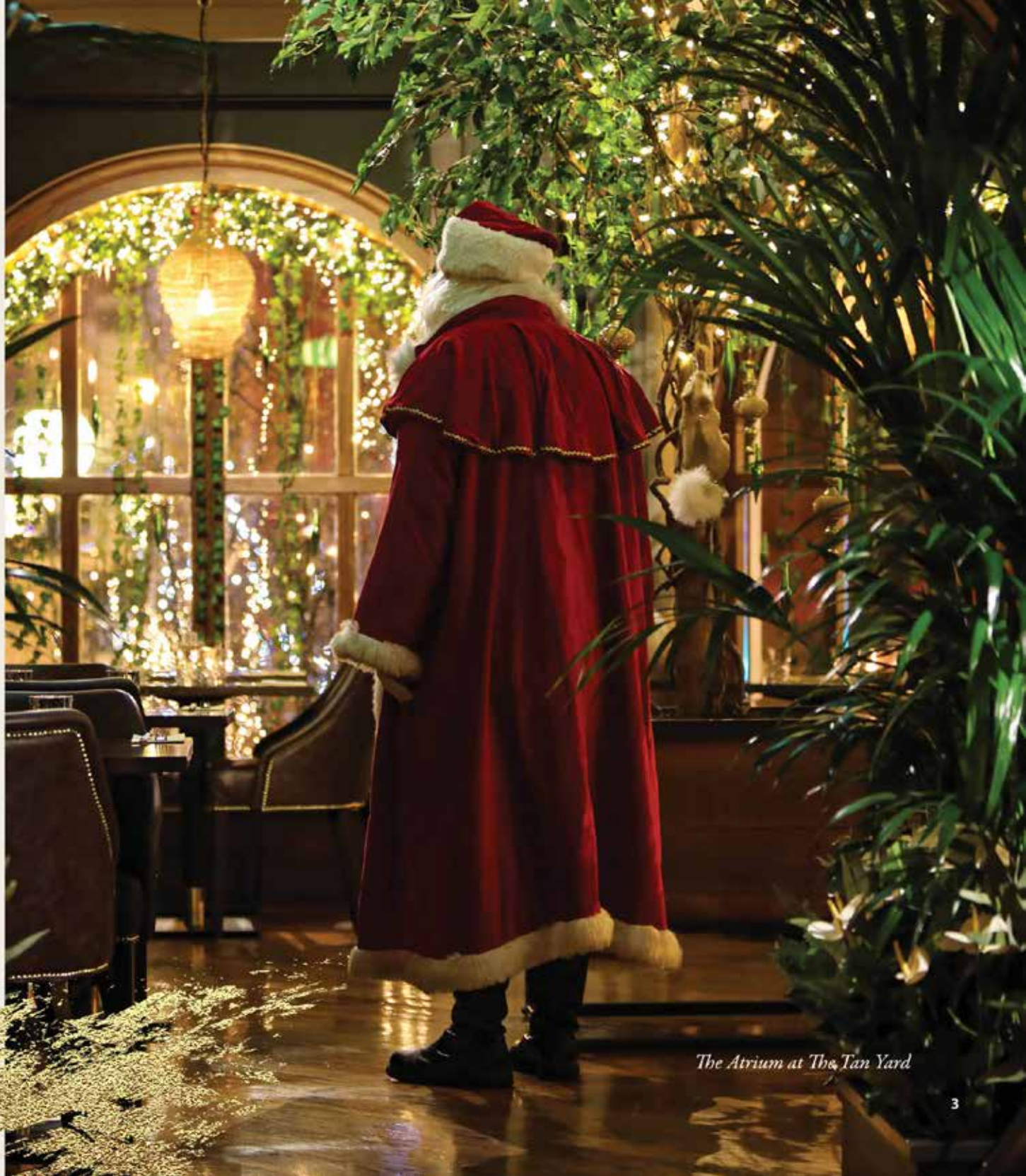
The Atrium at The Tan Yard